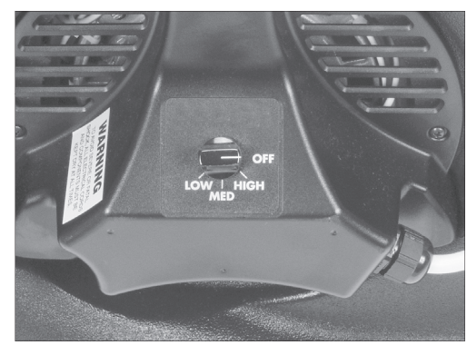
3 position switch

To use, push in release button, pull handle up until it locks into place. Tilt the unit back onto the wheels and roll to desired location.