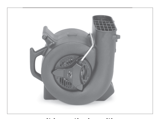
unit in vertical position